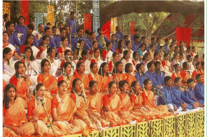
Musical function-at dawn at Ramna Park (Chbayanat)

Baishakh or the Bangla New Year's Day is celebrated in a festive manner in both Bangladesh and the Tripura and West Bengal states of India. In Bangladesh Pahela Baishakh is a national holiday, and usually falls on April 14.