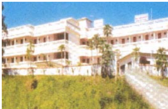
Parjatan Motel, Khagrachhari

Bangladesh Parjatan Corporation has modern and luxurious hotel, motel, & cottage accommodation with