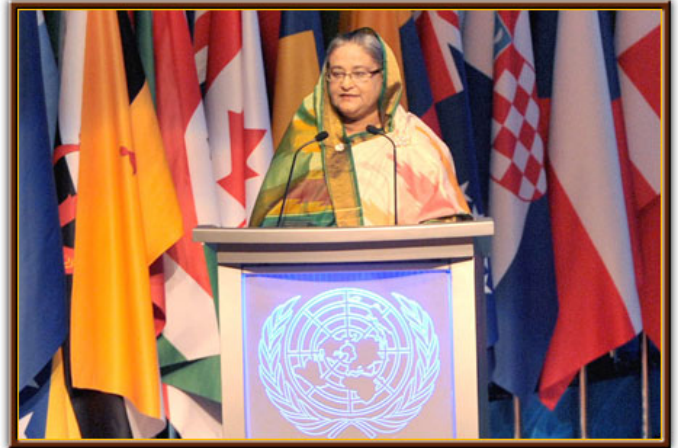
Prime Minister Sheikh Hasina addresses at the fourth UN conference on Least Developed Countries (LDCs) at Istanbul

The Hon'ble Prime Minister took part in the Fourth UN Conference on LDCs in Istanbul in May 2011. In her speech on 10 May 2011 she demanded more support of the affluent nations for the LDCs or emerging economies to enable them to attain sustainable economic growth. "Investment and