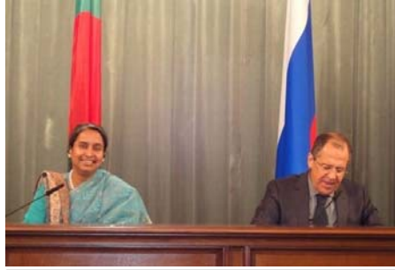
H.E. Dr. Dipu Moni with H.E. Mr. Sergey Lavrov

The Hon'ble Foreign Minister Dr. Dipu Moni, MP paid an official visit to Russia during April 6 – 8, 2011 where she had, among others, bilateral talks with her Russian counterpart HE Mr. Sergey Lavrov. The two Ministers reviewed the whole gamut of bilateral relations including economic, energy and power, trade, cultural, educational and defense cooperation. They especially discussed about the Russian cooperation in the construction of Nuclear Power Plant in Bangladesh, reviewed status of a number of proposed agreements and MOUs, duty free and quota free access for Bangladesh products to Russian market, exchange of diplomatic properties etc. The two Foreign Ministers also discussed different regional and international issues of common concern. During her visit, the Bangladesh Foreign Minister also had meeting with the chief executives of State Atomic Energy Corporation 'Rosatom' and the largest oil and gas exploration company 'Gazprom'.