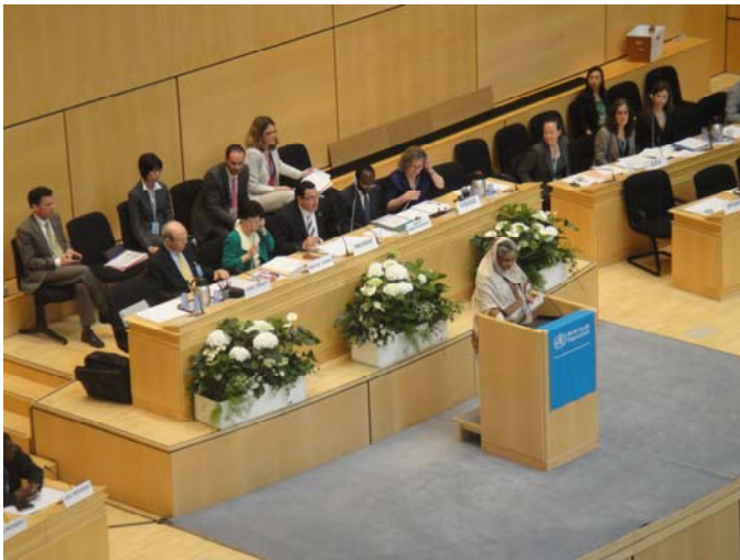
H.E. Sheikh Hasina addressed at the 64th Session of the World Health Assembly

Visit to Switzerland: The Hon'ble Prime Minister Sheikh Hasina attended the 64th session of the World Health Assembly (WHA) in Geneva in May (attended by 193 countries) and while addressing the session on 17 May 2011 she sought reforms of global health systems and institutions like WHO and increased financial support so that WHO could provide authoritative health services and technical support to member countries. She hoped that the global community would continue their support to Bangladesh's effort to make population an asset instead of being a burden. She also congratulated renowned philanthropist Mr. William H (Bill) Gates, Chairman of Microsoft Corporation and the Bill and Ms. Melinda Gates Foundation, for their magnanimous contribution to the global common good, espe-