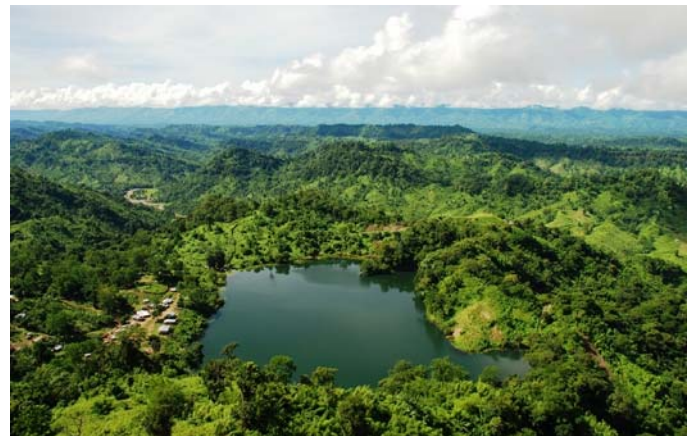
Lake of God

In the summer one should carry light clothes and an umbrella or raincoat because it rains quite a lot there.