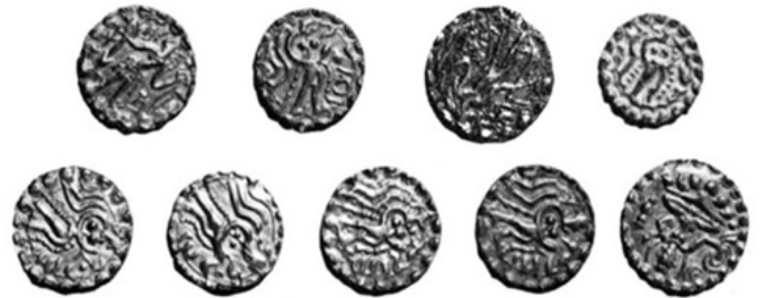
Gupta Imitation Gold Coin

It has revealed valuable information of the rule of the Chandra and Deva dynasties which flourished here from the 7th to 12th century A.D. The whole range of hillocks run for about 18 km and is studded with more than 50 sites. Of the 13 copper plates