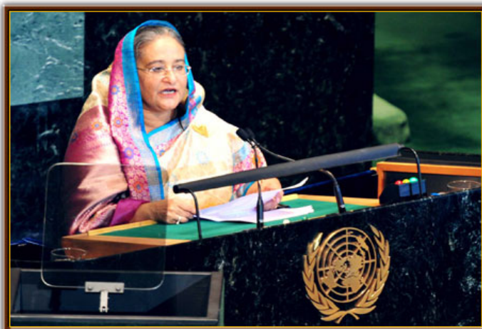
H.E. Sheikh Hasina addresses at the 65th UN General Assembly

level plenary of the UNGA convened by UN Secretary General, Prime Minister Sheikh Hasina urged the developed world to demonstrate sincerity