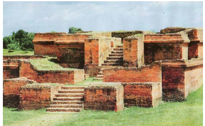
The ruins of 7th century Buddhist Monastery

Many good modern and luxury motels with restaurants are available in Comilla town. Besides, good restaurant facilities are available at Bangladesh Academy for Rural Development (BARD), which is not far from