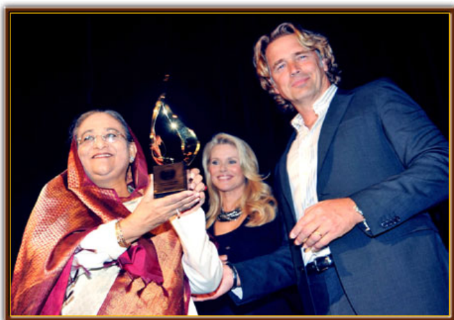
H.E. Sheikh Hasina receives a UN award for achieving one of the MDGs

Prime Minister Sheikh Hasina received a UN award during the UNGA in New York for Bangladesh's outstanding achievements in attaining the Millennium Development Goals (MDGs) particularly that of reducing child mortality. The award was conferred upon Bangladesh and five other countries a day ahead of the MDG conference held in the sidelines of the 65th UNGA. Speaking on the occasion, the Prime Minister said, "the award will encourage Bangladesh in strengthening its efforts for achieving all the MDGs by 2015 despite the adverse impacts of the recent global economic crisis and climate change". In her speech on the opening day of a three-day high