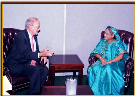
H.E. Sheikh Hasina with Dr. Anthony Lake

For more information about Prime Minister's Office and its activities, please visit the website www.pmo.gov.bd