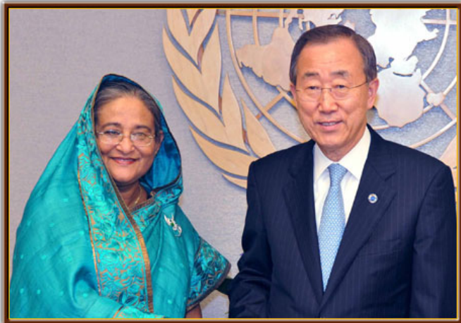
H.E. Sheikh Hasina with UN Secretary General Mr. Ban Ki-moon

Prime Minister Sheikh Hasina urged world leaders to do whatever is required for conserving global biodiversity. Addressing a High Level Plenary-Convention on Biological Diversity in New York, the Premier reminded the global leaders that biodiversity was worsening with increasing world population, poor people and poverty, adverse impacts of climate change and mindless exploitation of natural resources in total disregard to the natural environs harboring millions of species. ■