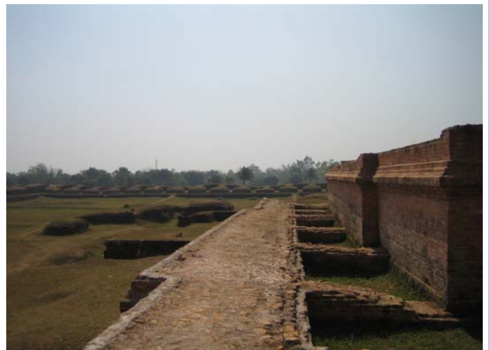
Partial view of Salban Vihara

recovered from Mainamati excavations, no less than 8 were from Salban Vihara, 4 from Charpatra Mura and 1 from Anada Vihara. Of nearly 400 coins found at Mainamati, 350 were collected from Salban Vihar, which included a few gold coins of the Guptas, Devas and the Khadgas. In contrast to Paharpur where the largest number of stones sculptures ▶▶