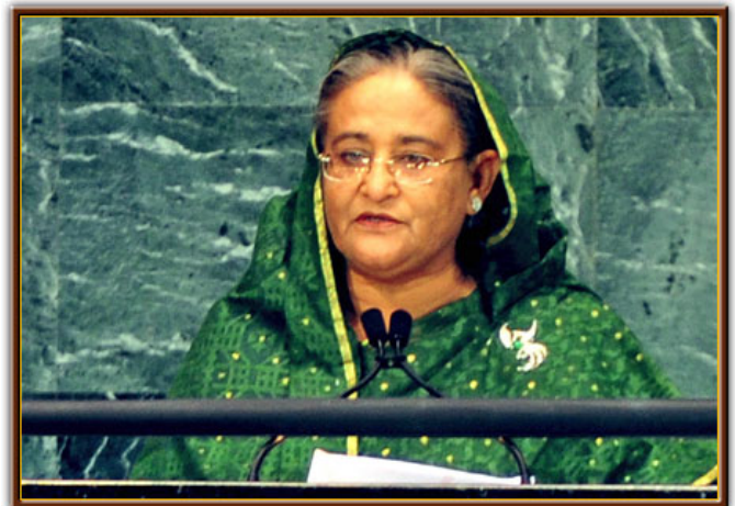
H.E. Sheikh Hasina addresses at the high level UN plenary meeting